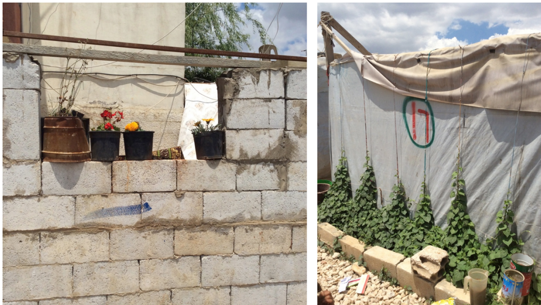
Fig.4. Re-creation of familiar landscape inside the Syrians Informal Tented Settlements

Referred to as a 'displaced population', Syrians in Lebanon are a vulnerable group that are denied access to housing, land, and property (HLP) rights. Albeit HLP are crucial rights for rebuilding the lives of uprooted people, Syrians, that are constrained in a condition of permanent temporariness, appropriate spaces and deploy a range of spatial and citizenship practices to strategically navigate their position (Hammett, 2017). The comfort of spatial identity in the Lebanese informal-scape is partly provided by the reconstruction and reshaping of vernacular landscapes of the region of origins in Syria and by the reorganization of space's hierarchy to recreate the familiar landscape (Fig. 4). The fears over the potential militarization of camps, the radicalization of Syrian refugees and the potential permanence of their presence have led the Lebanese Government to a rejection of formal camps (Turner, 2015). As a consequence, thousands of informal tented settlement (ITS) materialized all over the country with refugees living in overcrowded conditions in makeshift shelter clusters. The inside space is manipulated and adapted to the necessities of the occupants and transformed into a temporary home. This progressive shaping and re-adaptation of the space testify to the inhabitants' effort to reproduce the residential fabric of their original villages with their socio-spatial organization and division between public and/or private, open and/or closed.